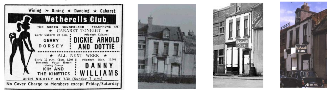
Image 1: Advertisement for Wetheralls Club in 1966.