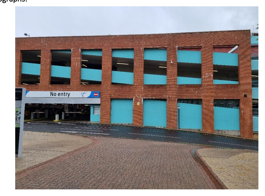
Image 4: Colour photograph of Wetheralls (No date, accessed via Sunderland History Memories Facebook Page). Current Photographs:

© Sam Neale, August 2022. Photograph showing the approximate location of Wetheralls.