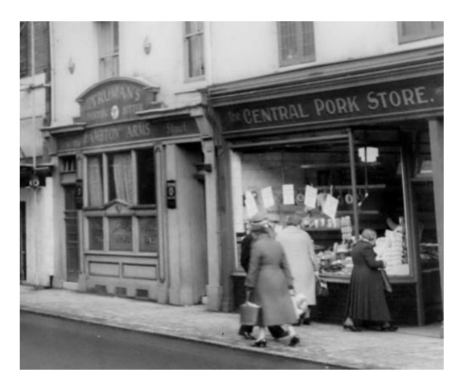
Image 1 – Photograph showing the Lambton Arms in c. early 20<sup>th</sup> century. Image 2 - Photograph showing the Lambton Arms in c. early 20<sup>th</sup> century.