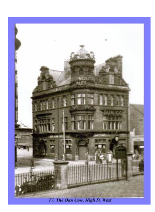
Image 1: The previous Dun Cow on the same site, which the current Dun Cow replaced in 1901.

Image 2: The Current Dun Cow under construction c.1901.