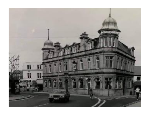
Image 1 – An early photograph of the former Peacock Inn before its demolition c. 1900

Image 2 – An early photograph of the former Peacock Inn before its demolition c. 1900