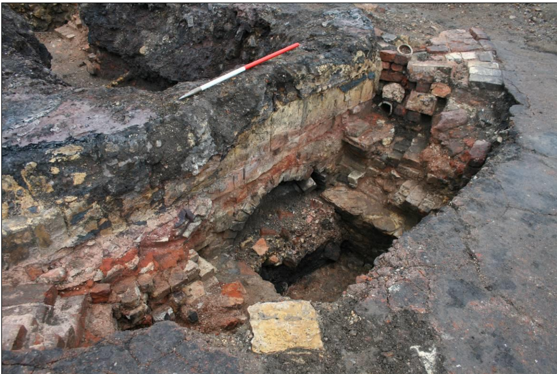
Southern glass cone with arched flue entrance