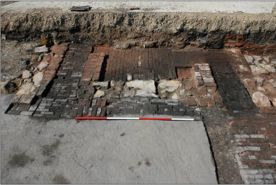
Annealing furnace working area