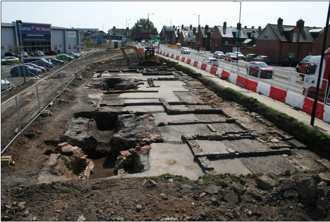
Main excavation area (looking south) with glass cones on left and annealing kiln and store rooms on right