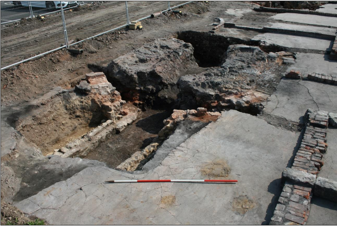
Northern glass cone