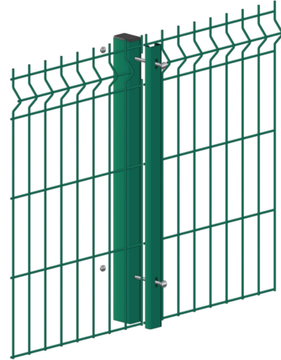
Wire Mesh Fence (RAL 6005 Green) 2.4m high