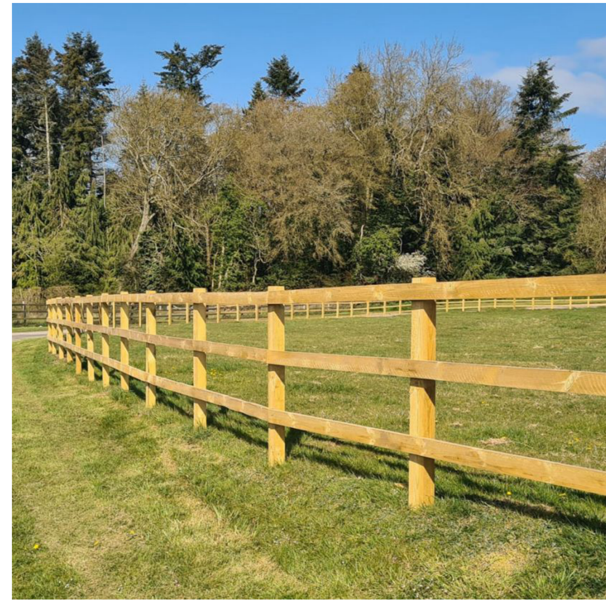
Timber Post and Rail Fence 1.1m high