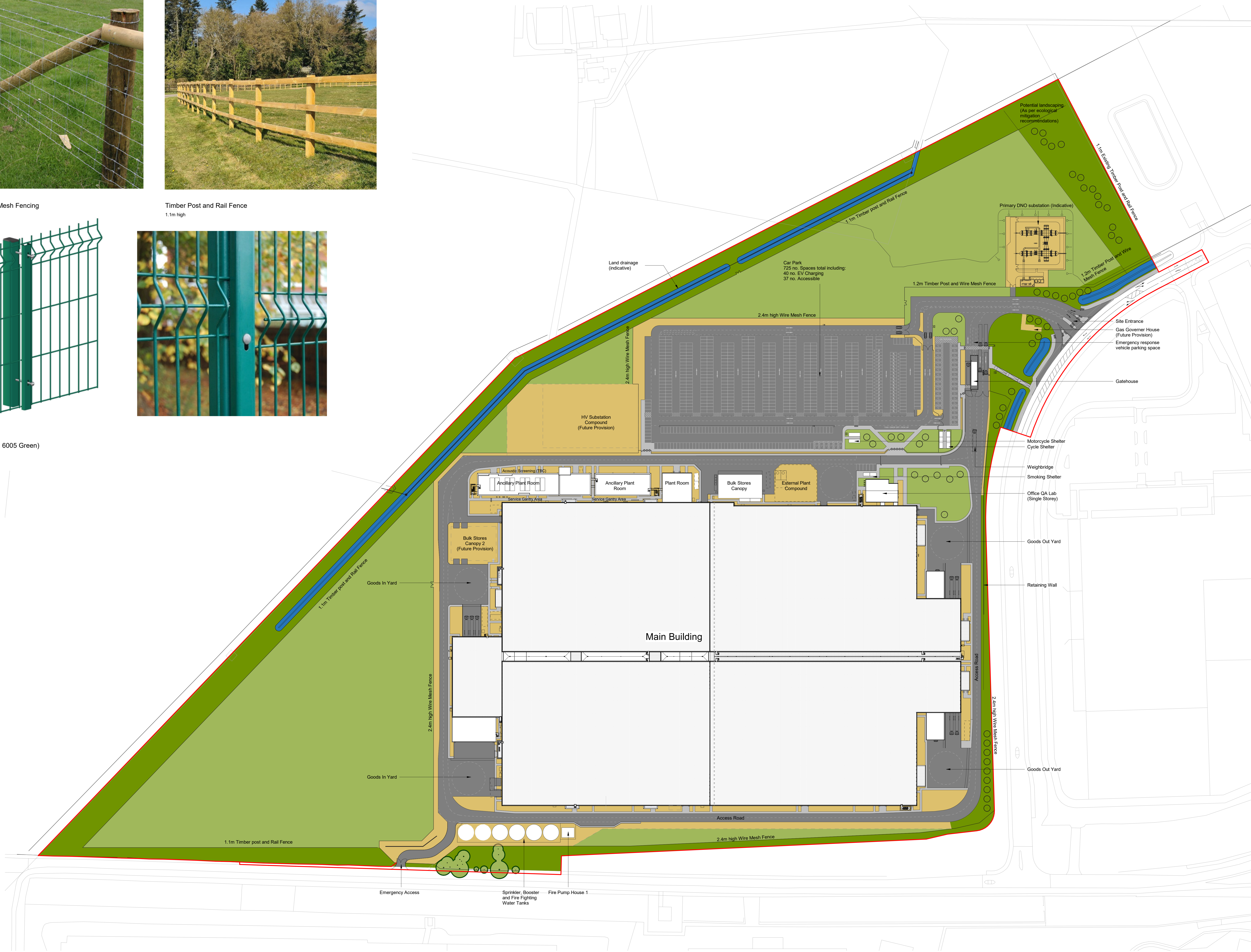
Site Layout 1: 1250