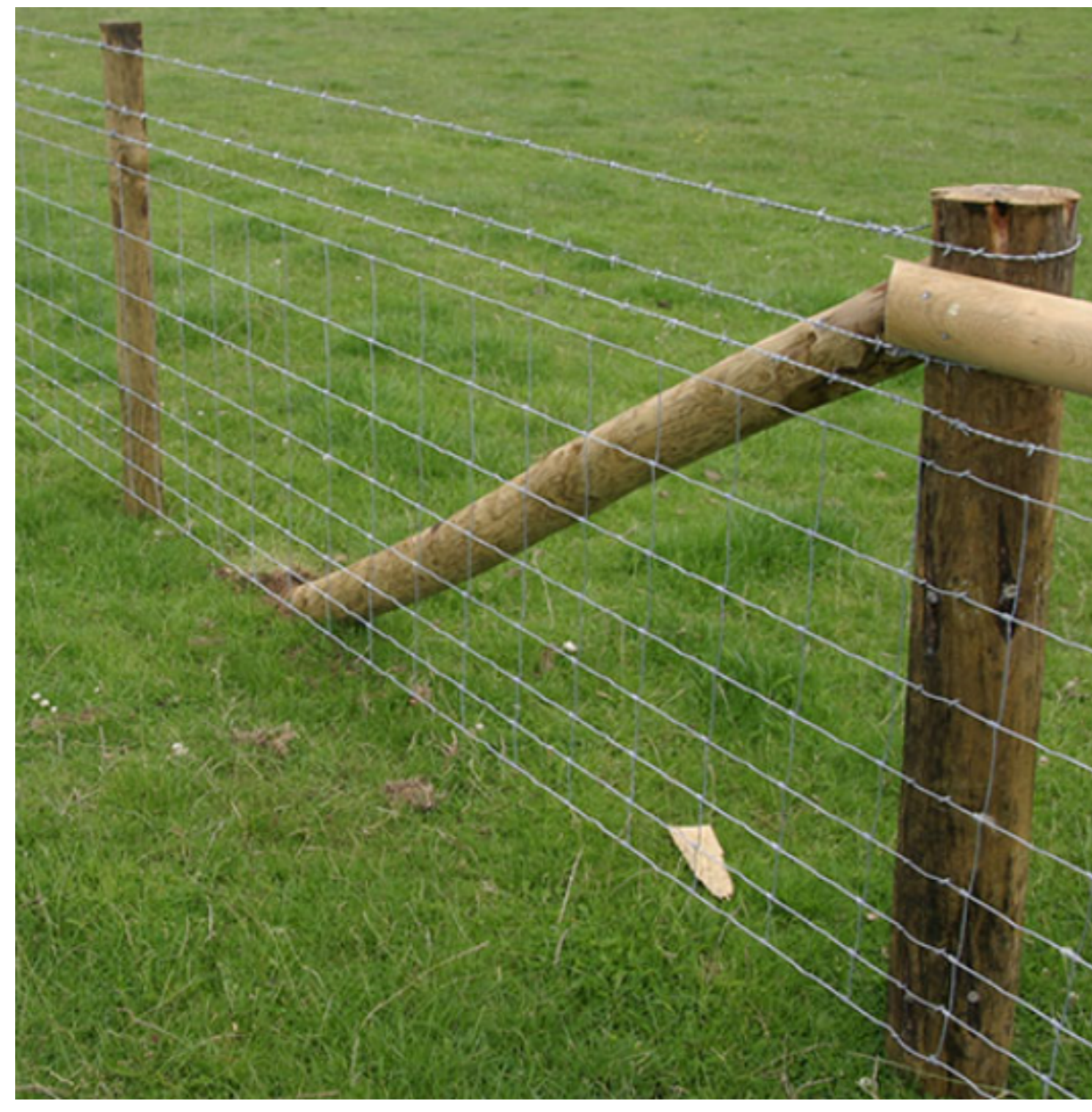
Timber Post and Wire Mesh Fencing 1.2m high